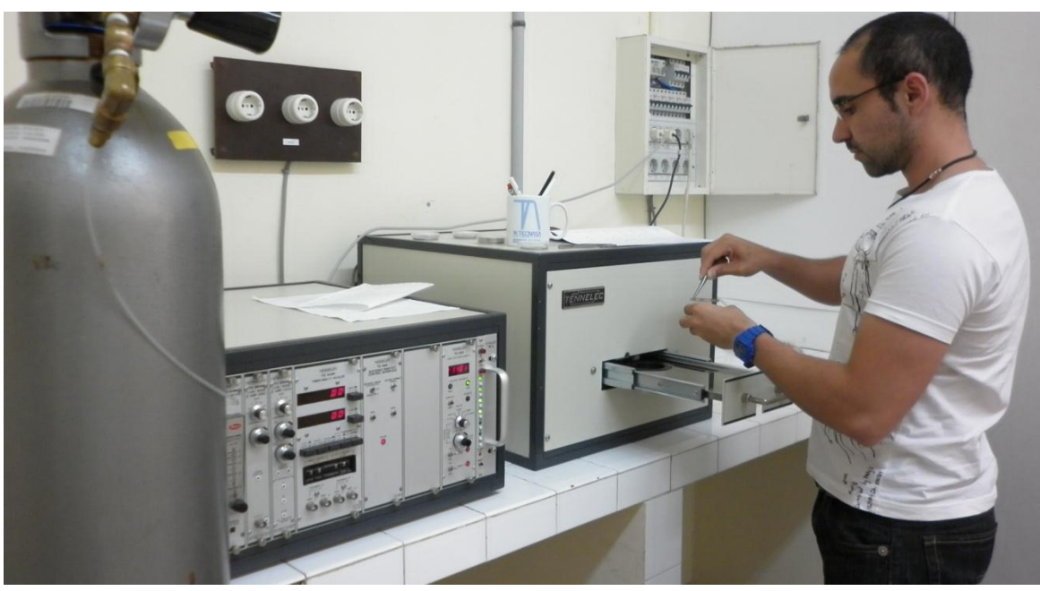
Low Background Proportional Counter.